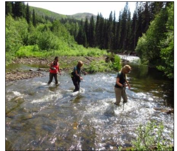
Bullmoose Creek Crossing