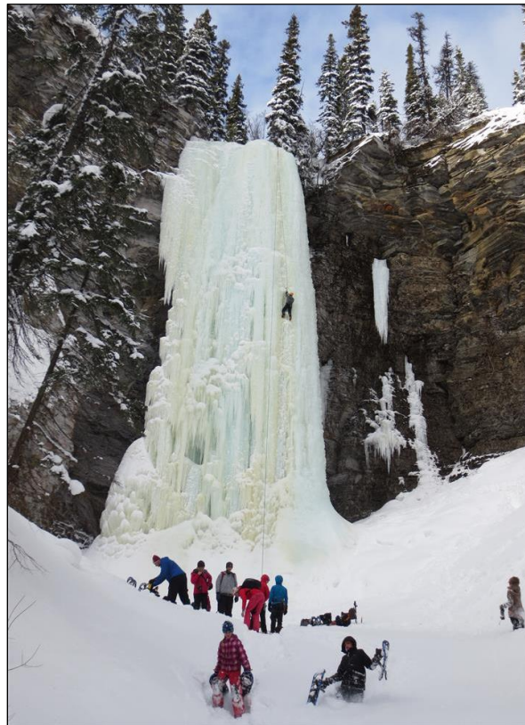
Bullmoose Falls in Winter

Bullmoose Falls is a popular snowshoeing and ice climbing destination in winter. The creek never freezes where the trail crosses, so wear appropriate footwear. Use extreme caution when approaching the frozen falls, as large chunks of ice can fall off at any time. This bowl is also prone to avalanches.